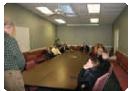
Men's Career Development Program