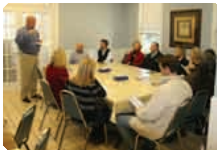
Pensacola Women's Rescue & Recovery Center