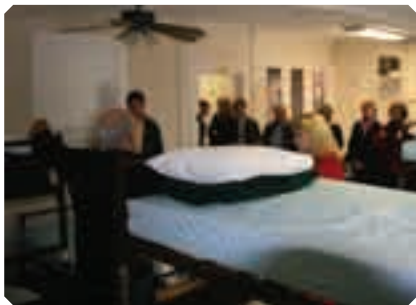
Mobile Men's Mission